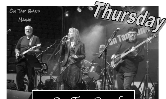
On Tap Band